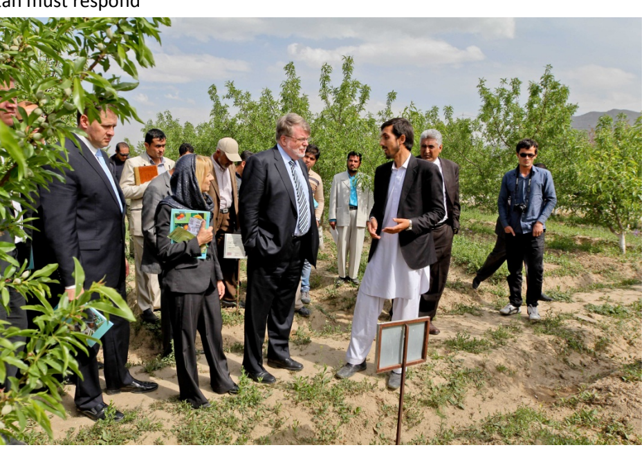
Figure 6. Mr Harry Jenkins MP and delegation members with staff at the Badam Bagh Demonstration Farm, Kabul

On the third day of its visit, the delegation inspected the Badam Bagh Demonstration Farm. Located in Kabul, the demonstration farm is an educational and research centre which assists Afghan farmers improve agricultural practices, use modern technology and access new markets. The farm grows fruits and vegetables in laser