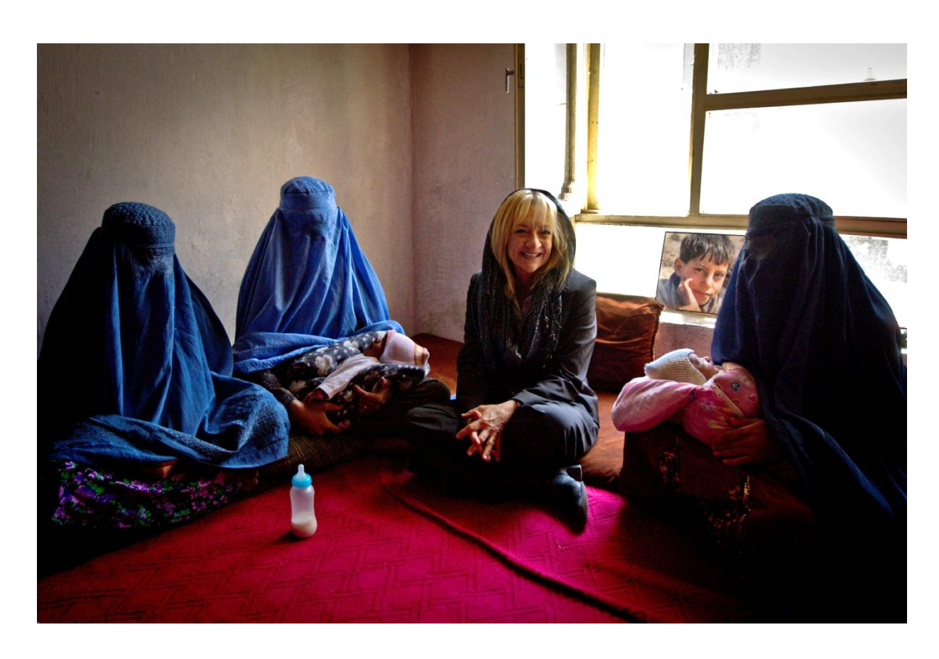
Figure 8. Ms Nola Marino MP, deputy delegation leader, with young Afghan mothers at the Kabul Informal Settlement

The delegation inspected the Sharak Aria site, where the WFP manages a program which provides for approximately 45 breast-feeding women and 25 children with moderate or acute malnutrition.