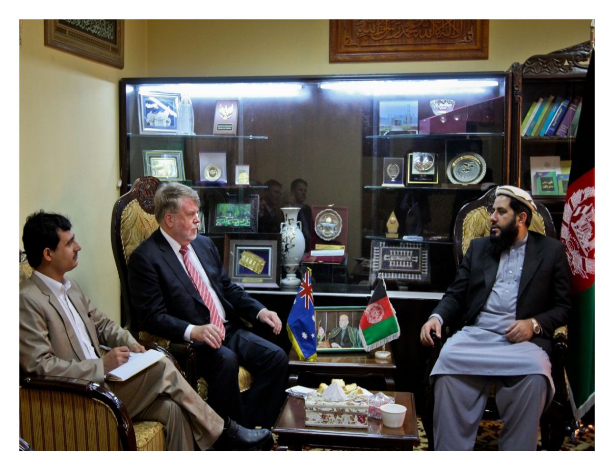
Figure 2. Speaker of the Upper House H E Mr Fazel Hadi Muslimyar welcomes Delegation leader Mr Harry Jenkins MP

Finally, as already mentioned, the delegation planned for 2012 was delayed because of security fears. The delegation was reassured by the excellent security measures in place during the visit. Members were attended by Australia's Defence Forces (ADF) in transit to Afghanistan, and protected by the private security firm Hart Security on the ground.