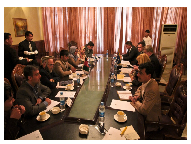
Figure 3. Information exchange with Lower House Natural Resources and Environment Committee chaired by MP Mohammad Zakria (left centre)

In the parliamentary compound, the delegation met with Lower House leaders, including Chairs of the International Affairs Commission, Budget and Finance Commission, Legislative Commission, Defence Commission, Applications and Complaints Commission, and Environment and Natural Resources Committee.