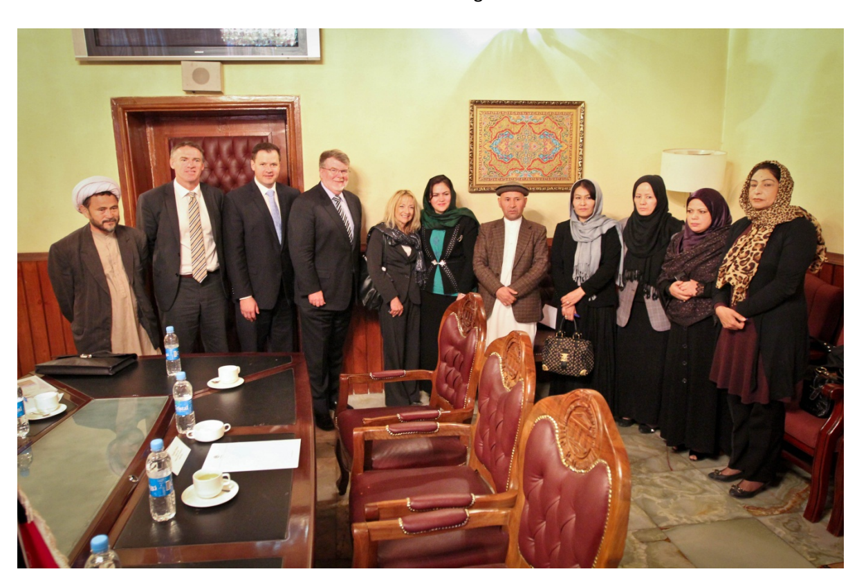
Figure 9. Meeting with Lower House Women's Committee

One of the most powerful impressions taken away by delegation members was that made by Afghanistan's women parliamentarians and by female officials and NGOs met during the course of meetings and visits.