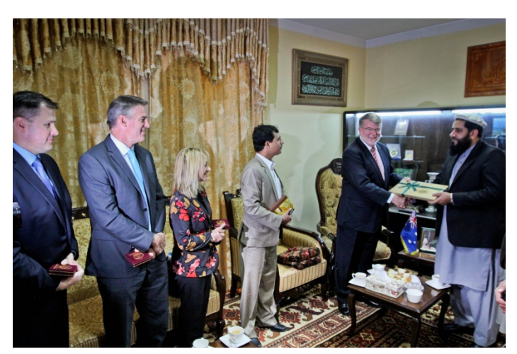
Figure 11. Exchange of goodwill gifts with Speaker of the Upper House H E Mr Fazel Hadi Muslimyar

the time is right to engage more closely and systematically with Afghan MPs, the public service and civil society members.